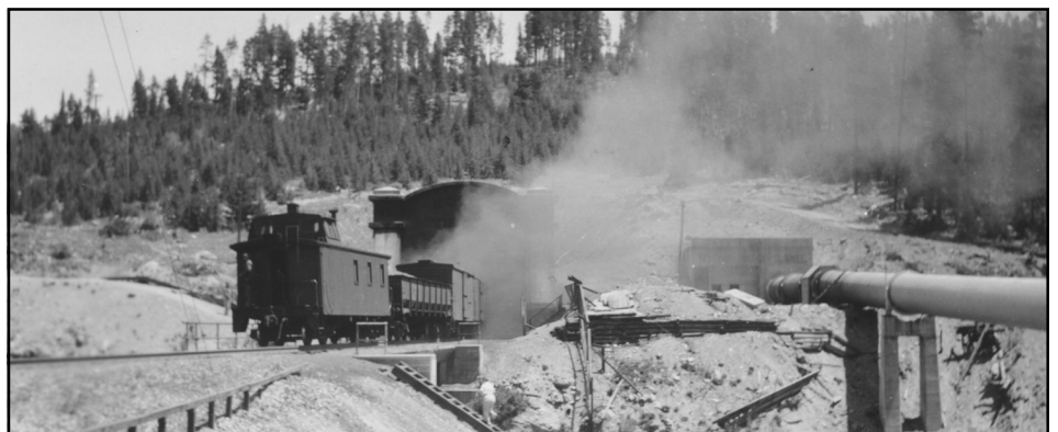
A Denver and Salt Lake freight enters the West Portal of the Moffat Tunnel on June 25, 1939

Everyone had an enjoyable evening. The museum volunteers said it was out of the ordinary for them. They mentioned they would like to do this again as it was fun. For us too.