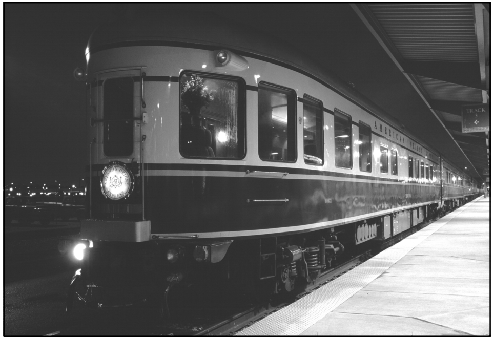
American Orient Express observation/bar/lounge car NEW YORK at Denver Union Station on 11/2/98 prior to departing on the final run of the 1998 season.

Omnitrac rebuilt Utah Railway GP-35 #2004 moved from Loveland, CO, arriving at BNSF's Denver Diesel Shop, Denver, CO, on 10/20/98. Unit wears fresh paint – gray, yellow and red scheme. It moved west via a BNSF trackage rights