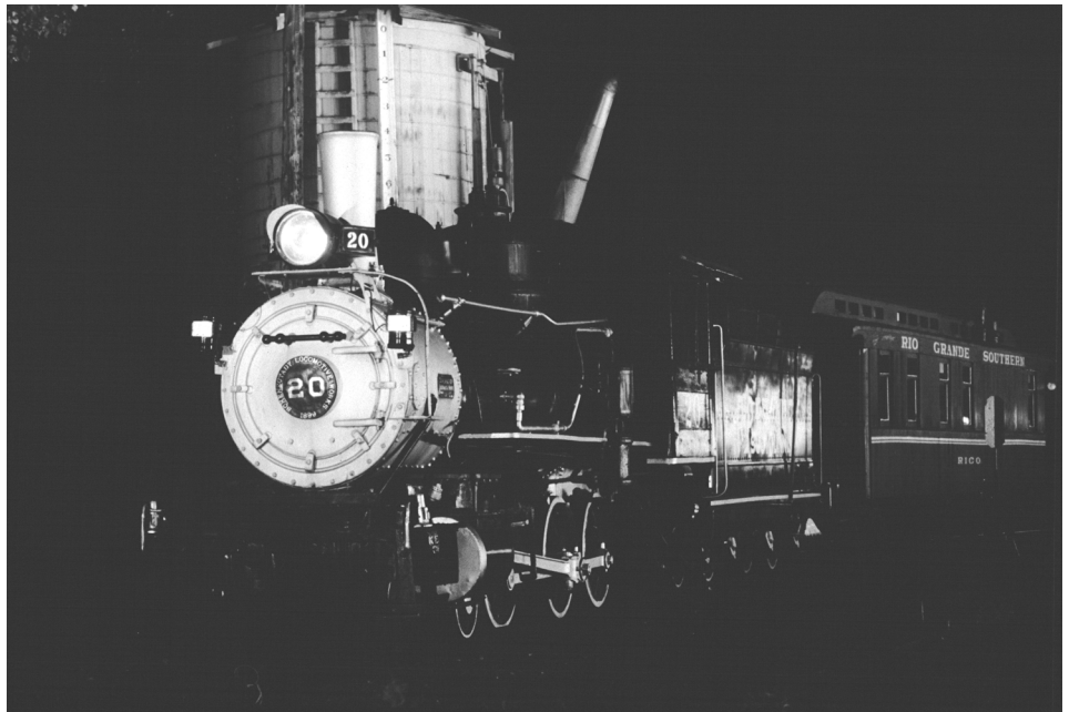
Club engine number 20 and the RICO spotted at No Agua at the Colorado Railroad Museum on October 24, 1998